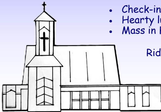
Our Lady of the Lake